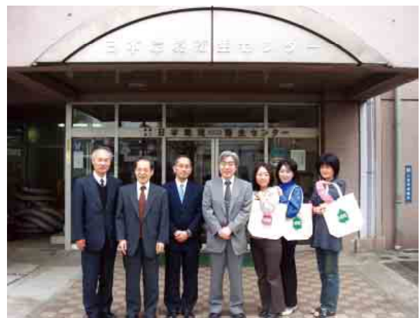
ICO Staff at JESC ( April 2008 )