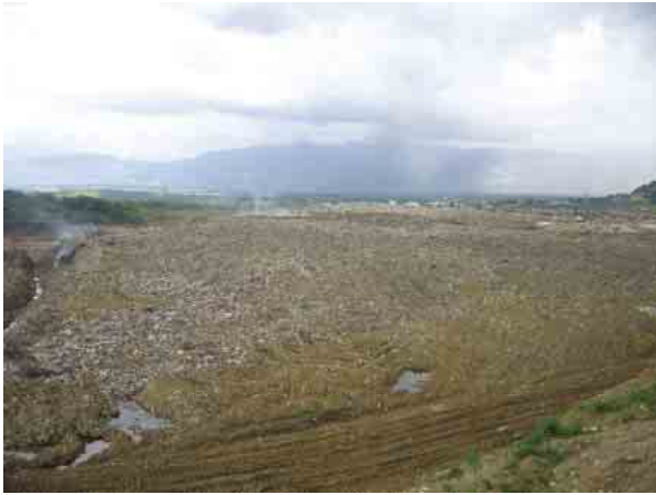
Smoke problem almost perfectly solved (January 2008)