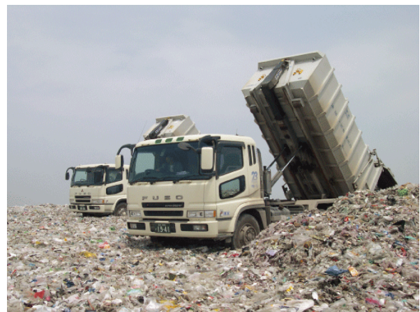
Final disposal site of Tokyo Metropolis (July 2007) Plastic waste occupied the largest part of the waste landfilled.

Although some residents were against the new system, saying that recycling plastics was not enough and incinerating plastics discouraged recycling, most understood the significance. Generally, citizens have cooperated with government to allow the successful introduction of the new system, which has now been running since April 1.