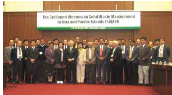
The 3rd Expert Meeting was held on Dec. 7-9 in Okayama in 2007.

The 4th Expert Meeting will be held in Yokohama on July 16-18 in 2008. The objectives of the Meeting are to discuss specific activity, to share knowledge on solid waste management, to discuss how to raise the level of solid waste management in Asia and Pacific Islands, and to promote international research cooperation.