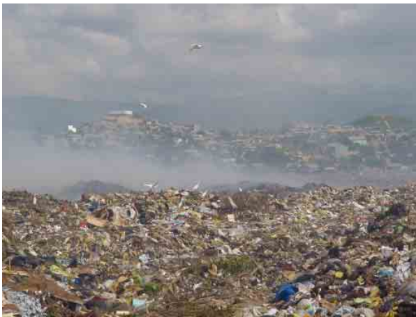
Serious smoke problem before improvement (December 2003)

year earlier. Work to extinguish the fires by covering the area with soil was proceeding and 70-80% complete. Excavation work on a new landfill site was complete and on schedule. The overall state of the work referred to in the action plan was checked, team members and local staff exchanged questions and answers on the plan's implementation, and training on the installation of the gas exhaust pipes was carried out onsite. Additional technical assistance on landfill was provided in the subsequent open seminar.