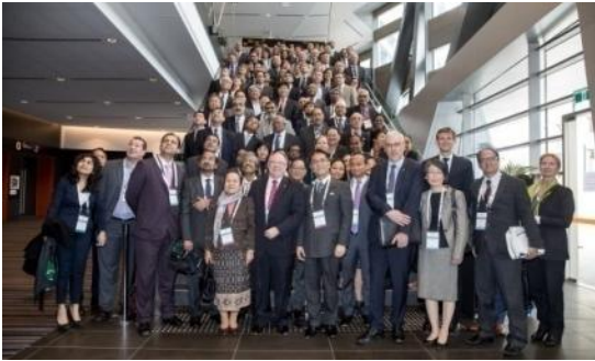
【The 6 th 3R Forum】

Audience: about 350 people from 41 countries