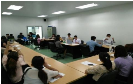
Panelist Screening Test in PCD (1)