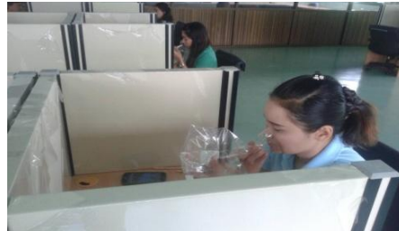
Bag Method testing