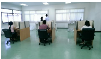
Odor Laboratory in PCD Triangular Odor