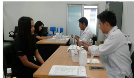
Panelist Screening Test in PCD (2)